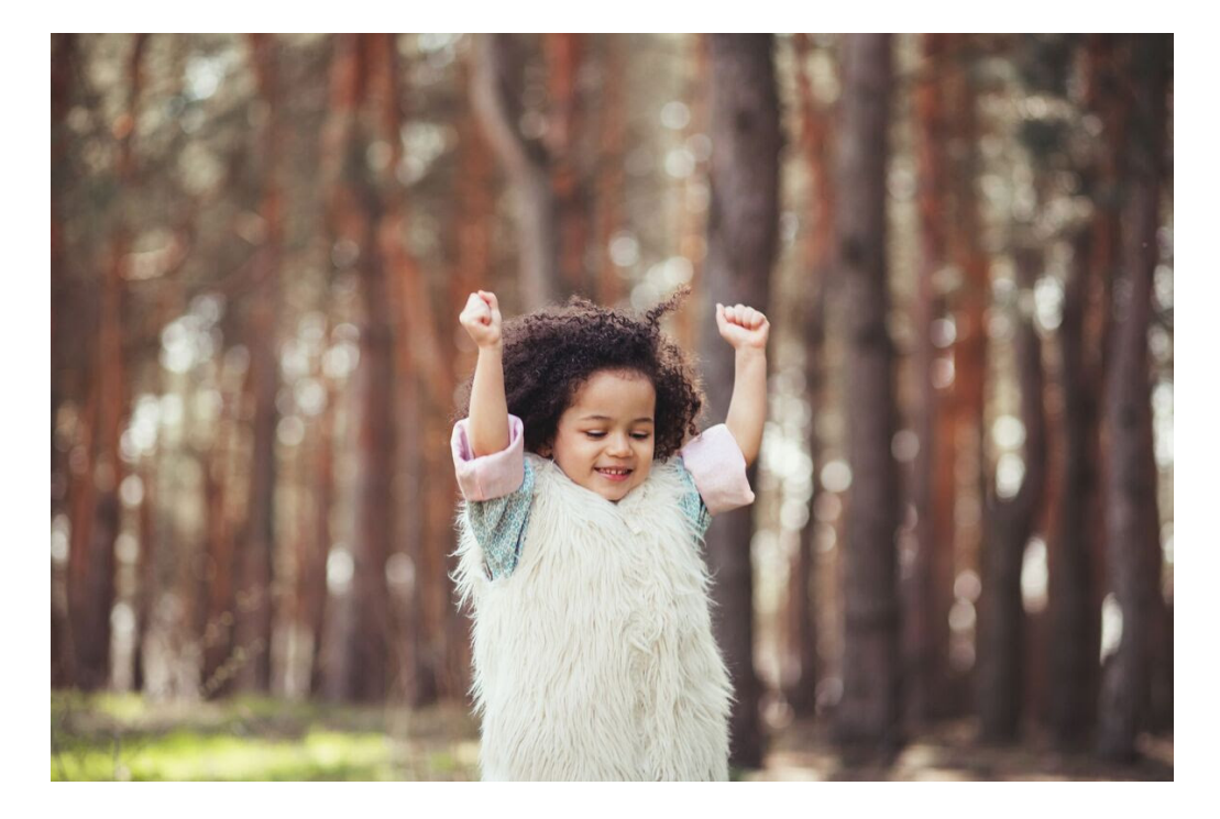
"Pfizer Pulls Small Child EUA Request"